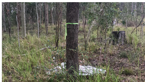
Scat collection and health checks for ex-situ populations